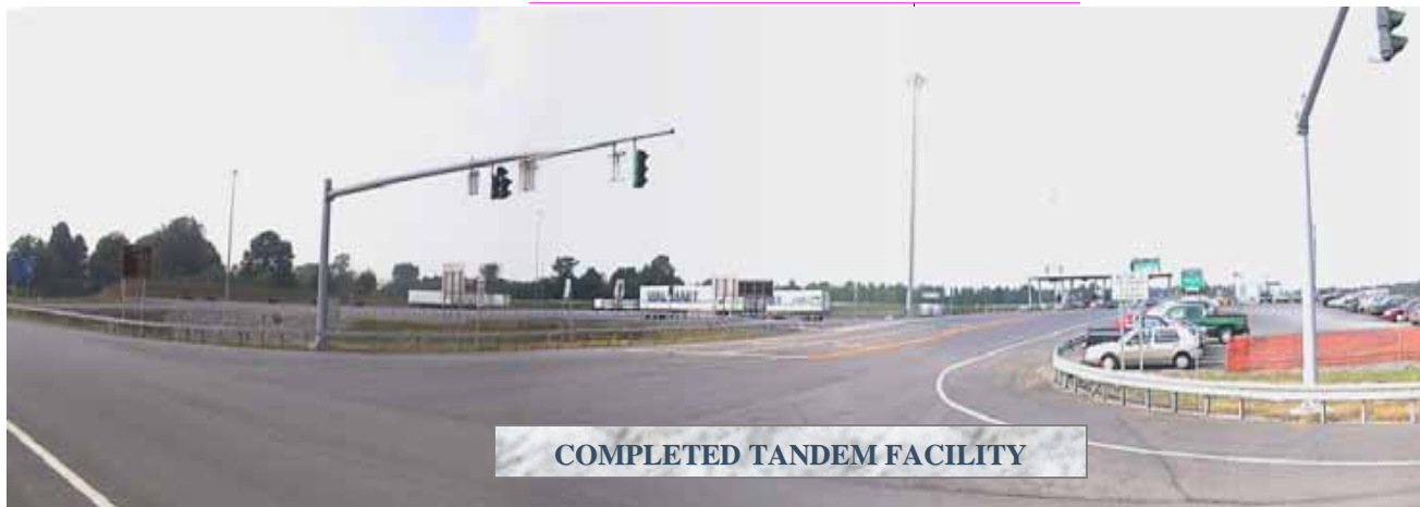
COMPLETED TANDEM FACILITY